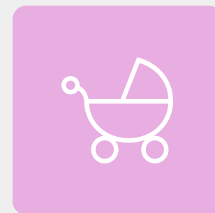
Car seats & Baby things