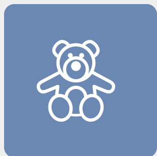
Finding and paying for child care

The plan of supportive care helps to identify current supports you have for you and your baby and can act as a guide to identify additional supports and resources that we can help you with. Talking with a care team member during your appointment will help to identify if you are eligible for help with some of the following: